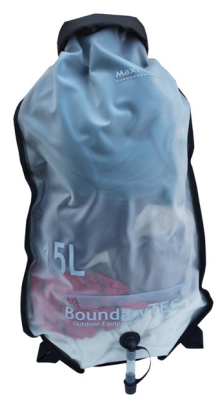
The system includes (2) 15L Universal Bags which can also be used as a solar shower, drinking water reservoir, or dry bag.