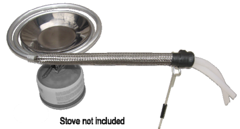
Stove not included

(2) 15L Universal Bags * Easy-to-fill roll-top bags seal in vapor and slow cooling, keeping water hot for up to an hour. * Waterproof RF welded construction using durable Nylon & TPU materials. * Purge valve can be used for decompression when used as a dry bag or as a utility water dispensing valve. * Lined with BPA free food grade polyurethane - Safe for storing drinking water as an alternate use.